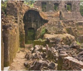
CARMICHAEL PRIZE ESSAY...